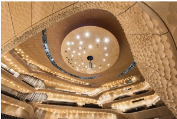
Photo 2: Zumtobel worked with Herzog & de Meuron and the glass designer Detlef Tanz from Wegberg to carefully craft 1200 hand-blown glass ball luminaires, which emerge from the undulating acoustic ceiling like light-filled water bubbles.