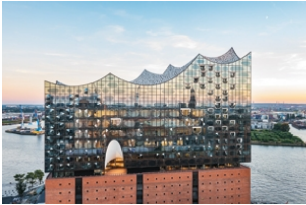
Photo 1: The Zumtobel lighting concept accentuates the magical atmosphere of Hamburg's Elbe Philharmonic Hall with a cultured lighting solution.