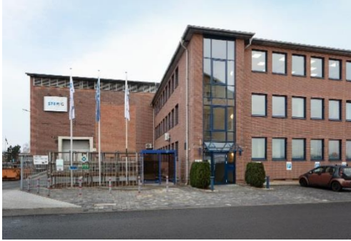
Fig. 3: Completely stress-free with a turnkey lighting solution: The ST Extruded Products Group (STEP-G) is taking advantage of a very special service after renewing the lighting at its Bitterfeld plant.